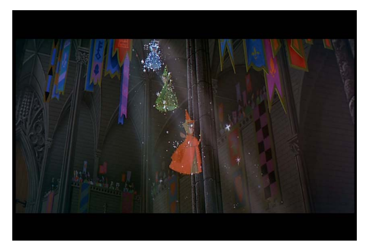
http://s32.postimg.org/7r6huq5ed/Sleeping Beauty Reel 1 K.jpg

"Fairies Enter" [Reel 1-K] 2/4 time, 48 bars, key signature of D maj (2 sharps). Bruns did not give a tempo marking but in the ballet we find Moderato in 2/4 time, also in the D major key signature. Dvd location: Chapter 4 starting at :05. CD location: Track # 3 starting at :06. Ballet location: CD # 1, track # 9 of the Naxos version. Instrumentation: Initially in the first two-dozen bars, it is the same as the ballet version except that Bruns adds the celeste. So we find the flute, the bells ("campanelli" in the ballet or otherwise known as the glockenspiel or orchestra bells), the celeste, and pizzicato violins. By Bar 9, the violas and celli add to the pizzicato effect, and the flute and oboe play the Canary Fairy development line.